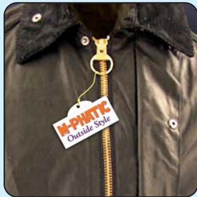
Special shapes complement your logo or design. Contact Customer Service for shapes with face slitting or holes.

Bleed must be 1/8" past the cutline. See Art Guidelines in General Information.