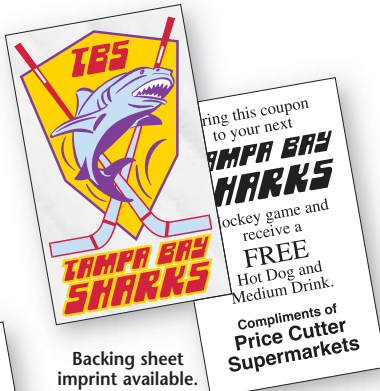
Backing sheet imprint available.