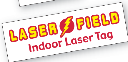
Imprint must be 1/8" past the cutline. See Art Guidelines in General Information.