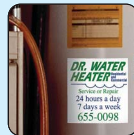
Durable decals for indoor or outdoor use.