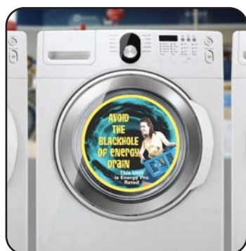
Decals with static on the back are ideal for point of purchase promotions.