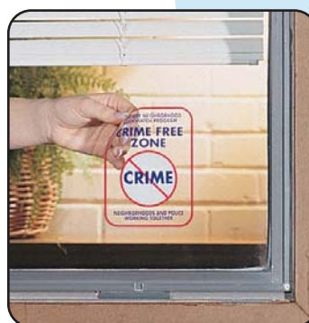
Decals with static on the face can be placed on windows in businesses or homes.