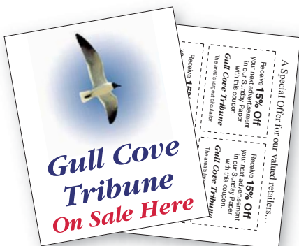
Black backing sheet imprint available.